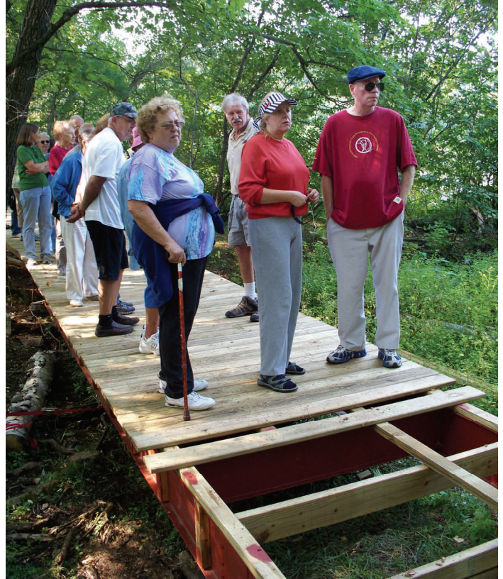
Some of the 25 people who toured Gibson Island in September stand on a completed portion of the boardwalk. The remainder is expected to be completed by spring, allowing pedestrian access to the nature trail.

Please spread the word that snowmobiles and other motorized vehicles are not beneficial to the protection of the island environment. Only pedestrians, snowshoes and cross country skis are allowed.