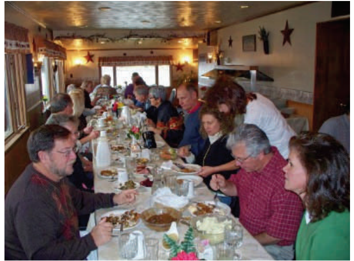
Some of the volunteers who were honored by the Cloverleaf Lakes Protective Association enjoy a luncheon at Popp's Lake Aire.